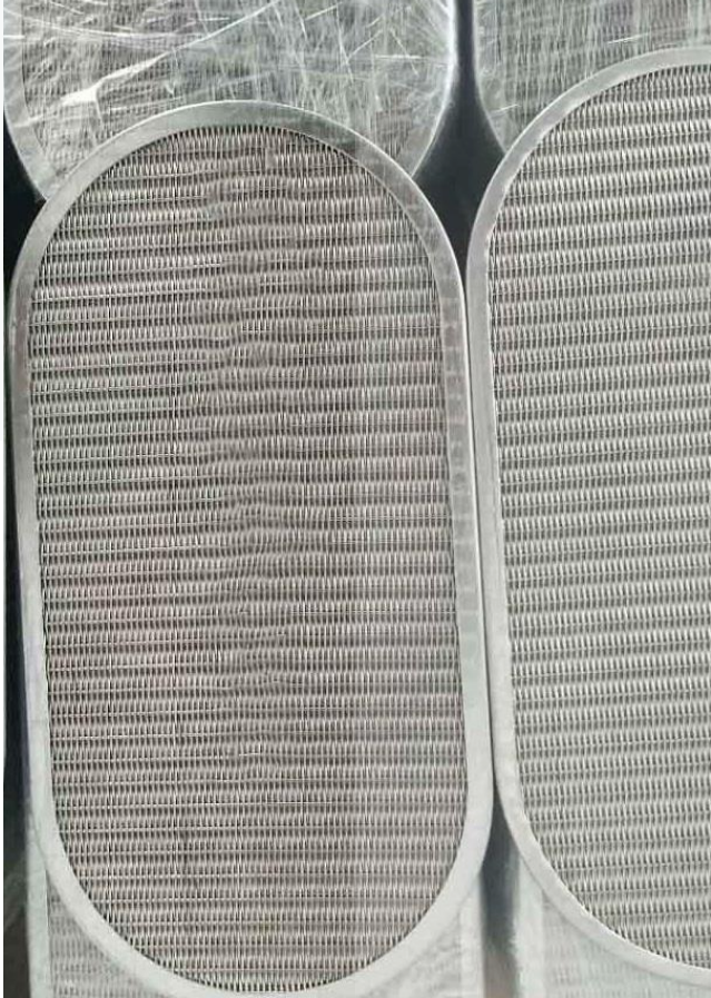
6. In-Line Mesh Gasket 7. Pleated Filter Disc screen 8. Polymer Filter Screen