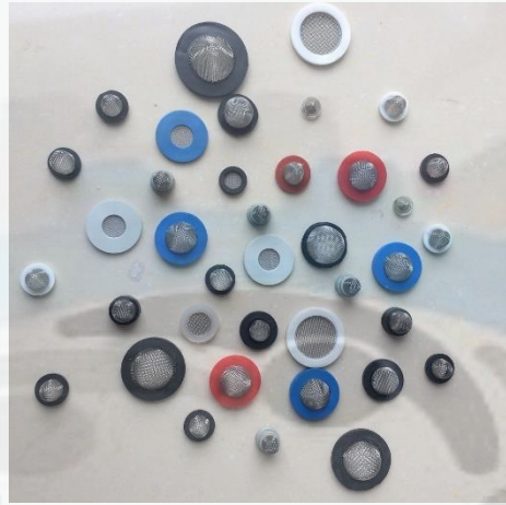
1. Brass Filter Disc Mesh 2. Excavator Diesel Filter Screen 3. Extruder Screen Pack 4. Stainless Steel Filter Disc Screen 5. Washer Filter Mesh